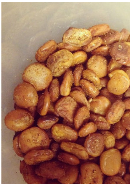
Lupini bean snack

Do you have a new favorite type of bean? Yeah, so far I have a favorite new one that I knew about but had never really used before. It's the lupini bean ... I soaked it for three weeks and it was still hard, but it has this reputation. I ended up turning it into just a snack because it was so - like [after] three weeks, still kind of hard, I put it in the crock pot for like three days...nothing. I researched and thought maybe it was just a bad batch or whatever and it's not. The bean is just like that. Italians are known for even putting it in their bath tub and running it constantly...I don't even know why I bothered. But I tried. So I ended up making a little crunchy snack.