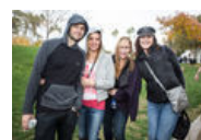
Vegetarian Food Festival at Scottsdale Civic Park