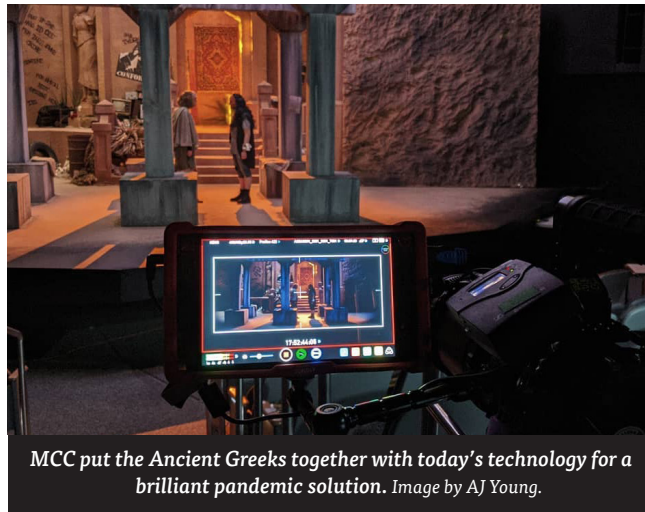
MCC put the Ancient Greeks together with today's technology for a brilliant pandemic solution.